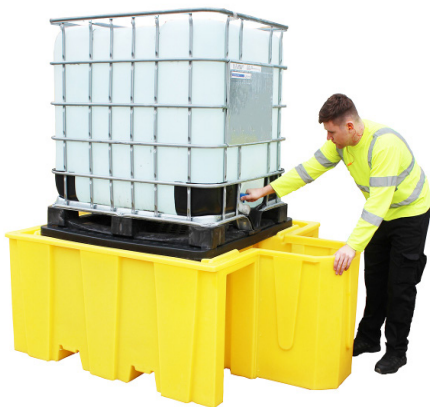
BB1DG - Grid included