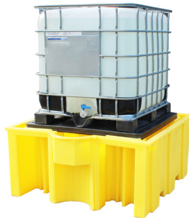
BB3G - Grid included