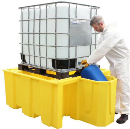
BB1D - Grid not included