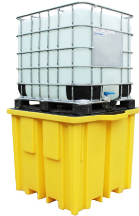
BB1FW - Grid included