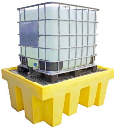
BB1 - Grid included